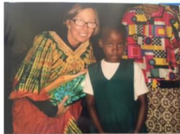
Bringing gifts from St. Bede